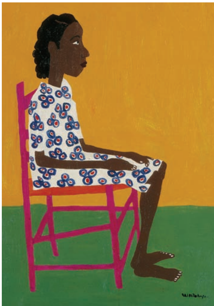
Little Sweet (1944), William H. Johnson. Oil on paperboard, 28" × 22". Smithsonian American Art Museum, Washington, D.C.

What do you infer about Mama from her description of herself? Cite specific details.